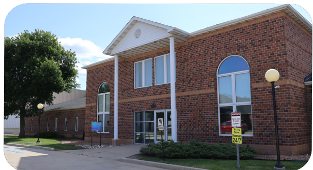
North Campus - High School and Middle School